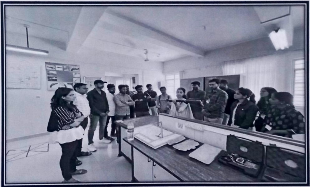
Study Tour at Government Forensic Science Department, Chha. Sambhajinagar